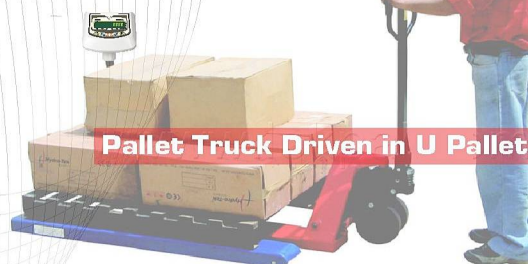
Pallet Truck Driven in U Pallet

AXIS ELECTRONICS G-72, UPSIDC INDUSTRIAL AREA, SELAQUI, DEHRADUN, UTTARAKHAND WWW.WEIGHING.IN ITEM: SUGAR DHAMPUR LOT#: 25c11 DATE: 22.12.12 S.No GROSS(kg) TIME 001 10.54 13:20 002 10.50 13:21 003 10.64 13:22 004 10.50 13:22 005 10.60 13:23 006 10.55 13:23 TOTAL 63.33kg X 6 Nos YOU ARE WELCOME