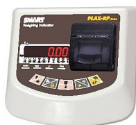
Ti10 Weighing Indicator With Printer